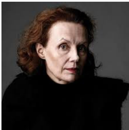
Featured composer Kaija Saariaho